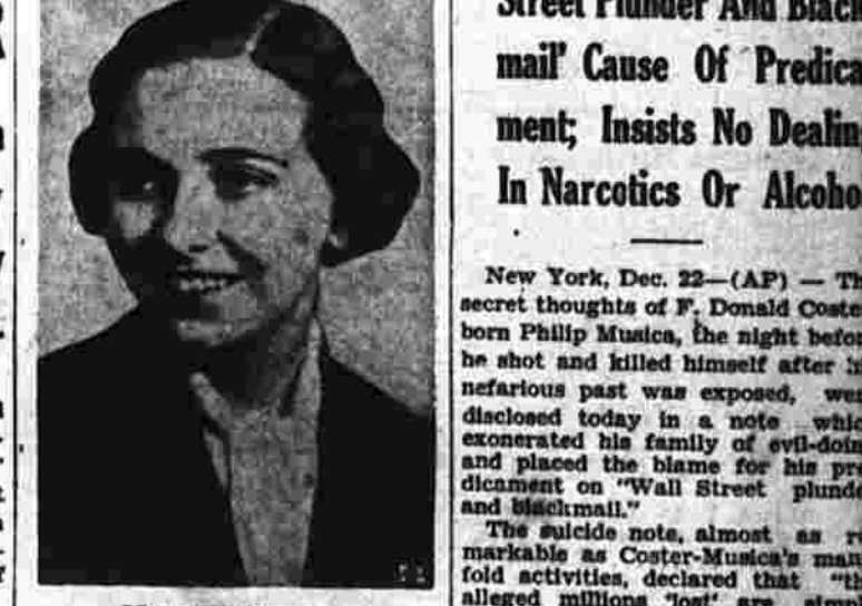
Search for Slayer of Girl Job-Seeker

New York, Dec. 22.—(AP)—The secret thoughts of F. Donald Coster, born Philip Musica, the night before he shot and killed himself after his notorious part was exposed, were disclosed today in a note which Coster-Musica's mother placed in the hands of his family.