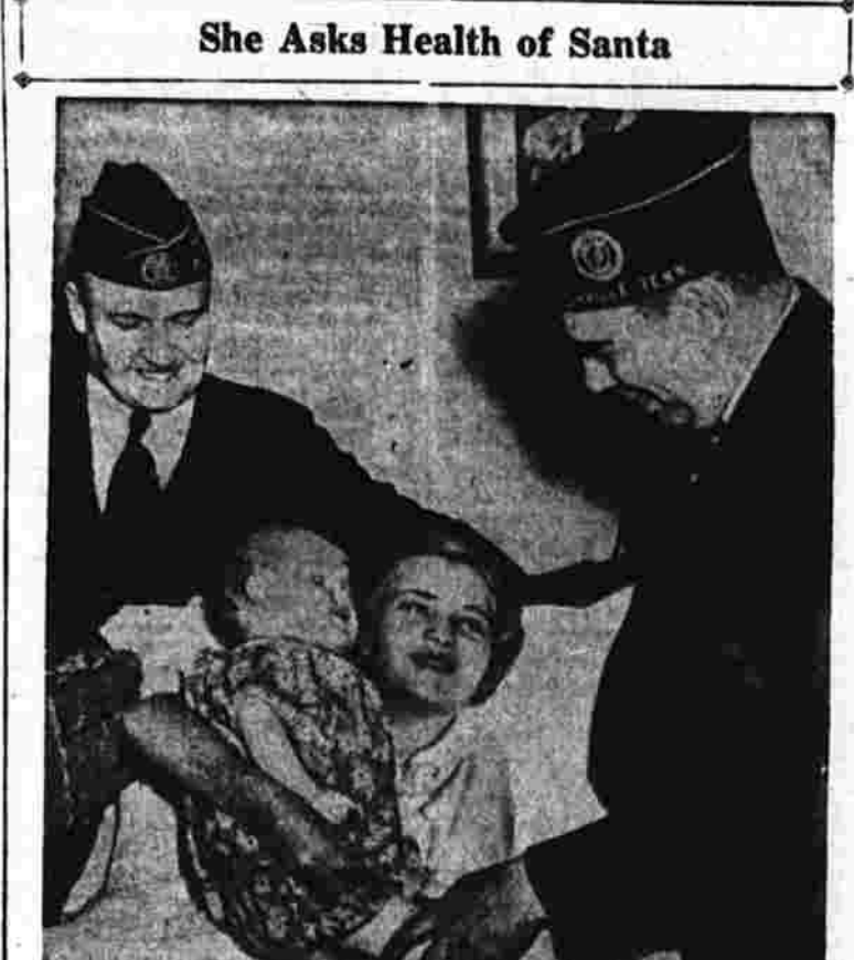
She Asks Health of Santa